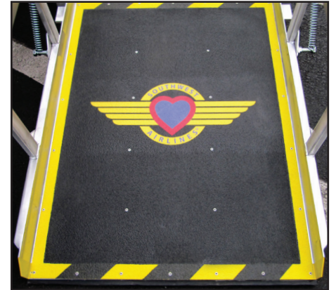
Corporate logos accentuate branding

We can incorporate logos, Personal Protection Equipment (PPE) symbols, escape route information, and directional markings on our Covers. Our Safeguard Descriptive Marking is inlaid and will last the life of the product.