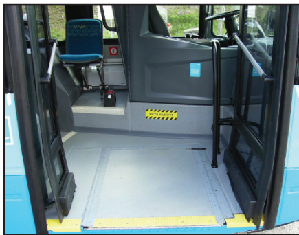
Trim assemblies can be direct gritted to match coach colors

Safeguard's unique Anti-Slip surface is universal, regardless of what it is bonded to. Choose from a variety of base materials of construction depending on your application. Covers are available in Flexible PVC (vinyl), pultruded FRP composite fiberglass, stainless steel or the SAFEGUARD® surface can be applied directly to customer supplied material.