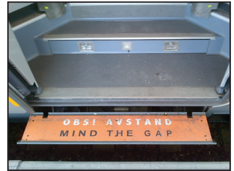
Safeguard® Descriptive Messaging on train steps