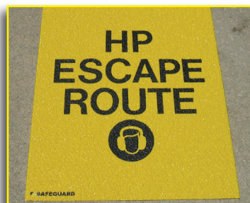
Hi-Traction® Safety Yellow Walkway Covers are available in custom sizes, colors and configurations

Hi-Traction® Ladder Rung Covers are prefabricated for fast and easy on-site installation over stairs, walkways, decks, and ladder rungs. The Covers can be installed using screws, bolts and nuts or liquid adhesive, depending on the application.