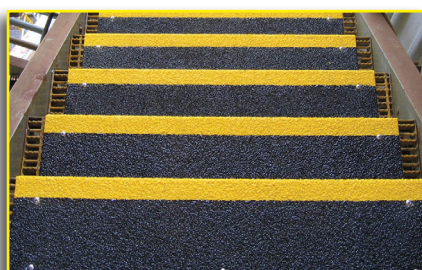
HiGlo-Traction®, Glo Safety Yellow Step Cover (Daytime)

Hi-Traction® Walkway Covers are made of lightweight, durable pultruded or molded composite fiberglass (FRP), galvanized or stainless steel, depending on the application. PPE and critical safety messaging as well as company logos are also available options.