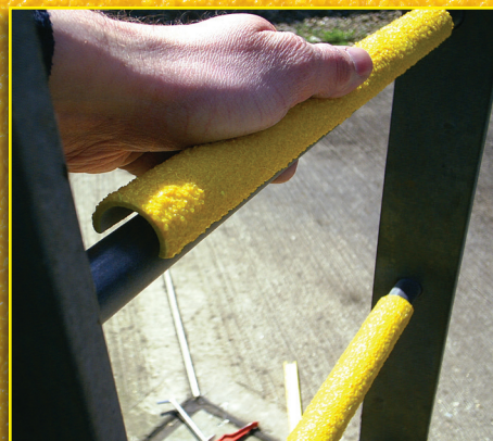
Hi-Traction® Ladder Rung Covers offer Anti-Slip protection for additional safety in the most dangerous work areas

Safeguard® Hi-Traction® Covers are an excellent long-term safety investment compared to anti-slip tapes or paints that cost more money and time in the long run. Safeguard also backs its Hi-Traction® Covers with a 5 year warranty.